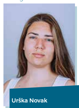
Acting Vice Dean for Student Affairs